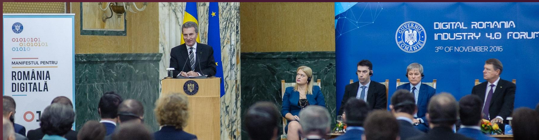
The opening of the first edition of the Digital Romania International Forum -- Industry 4.0. Pictured from left to right: European Commissioner Gunther Oettinger, Minister Delia Popescu, Minister Dragos Tudorache, Prime Minister Dacian Ciolos, and President Klaus Iohannis

Background: The first edition of the Digital Romania International Forum was organized under the auspices of the Romanian Government in 2016. The Forum was keynoted by Klaus Iohannis , President of Romania; Dacian Ciolos , Prime Minister of Romania; and Gunther Oettinger , European Commissioner for Digital Economy and Society. Over 300 CEOs from automotive, IT&C, and agriculture attended.